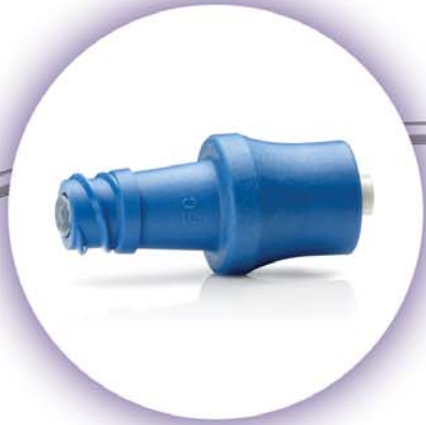
LifeShield® CLAVE® Connector