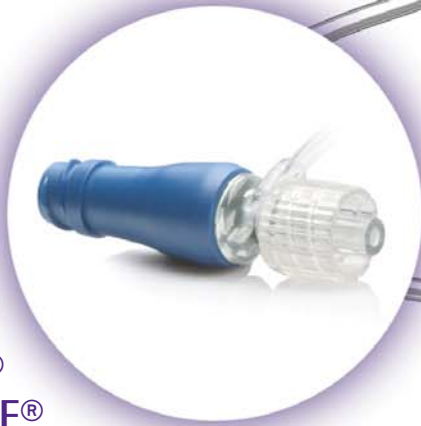
LifeShield® microCLAVE® Connector